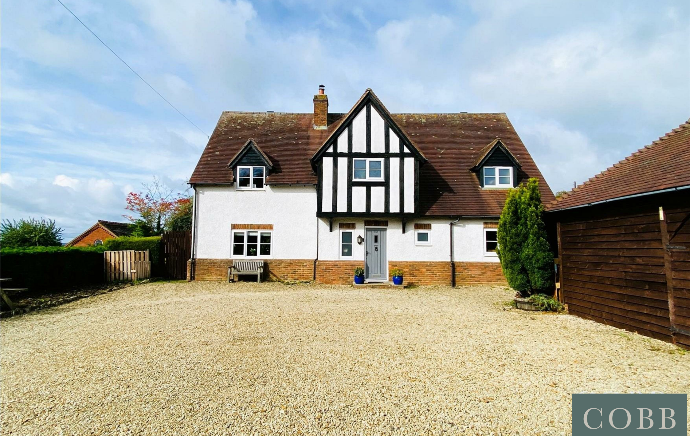
Brazendales House, Whitewayhead Lane, Knowbury, Ludlow, SY8 3LE Offers In The Region Of £650,000